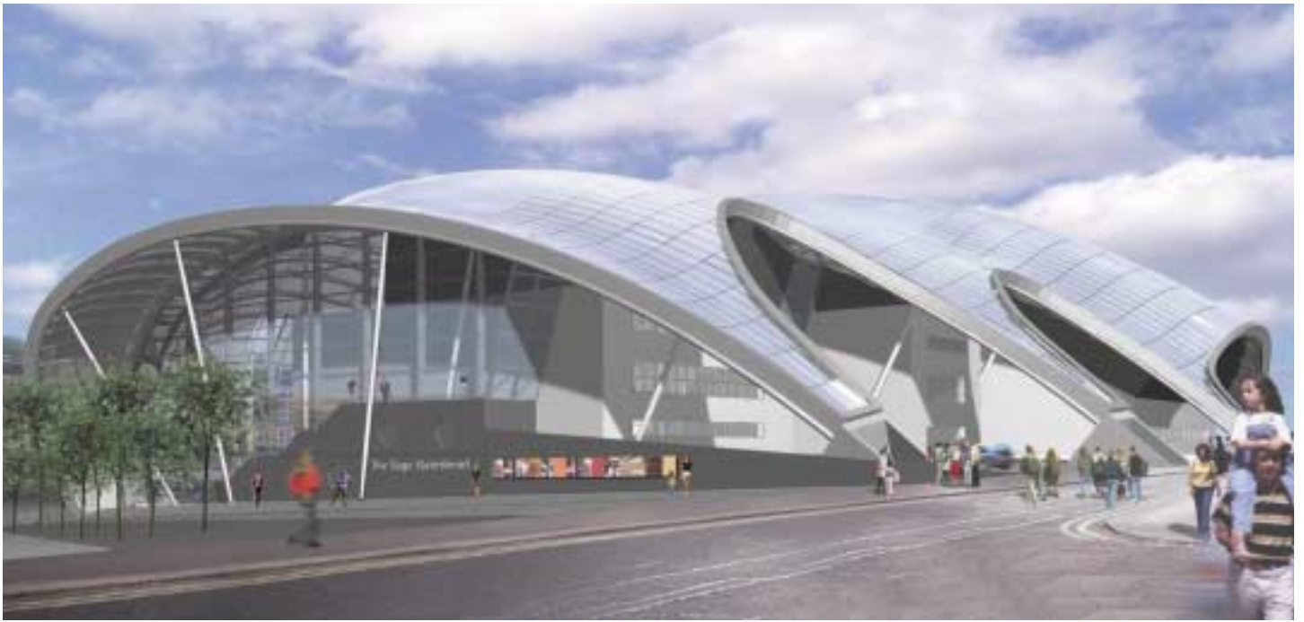
Computer generated image of The Sage Gateshead