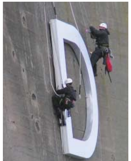
Two of the Isis team prepare to remove the final letter

If anyone can help find 'Landmark' a home please call the Samling Foundation on 01434 602885.