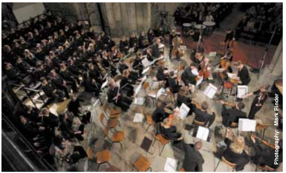
St Joseph's R.C. Middle School choir and members of Southbank Sinfonia in Hexham Abbey