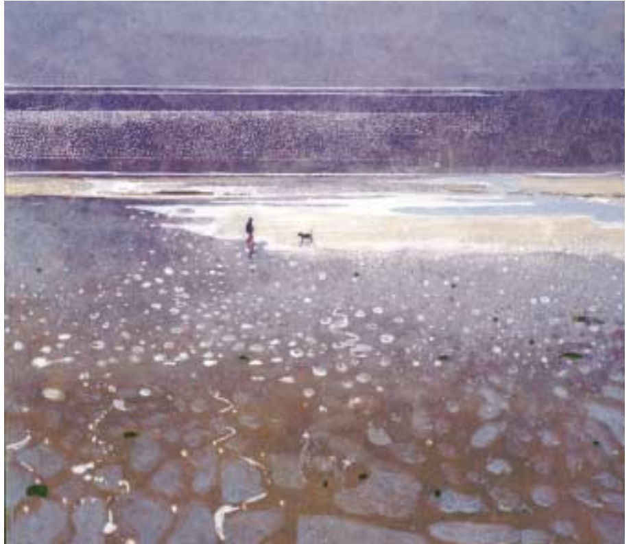
'The Roseland Peninsula' (122 X 112 cm) Medium: Egg Tempera and Watercolour

Exhibition dates Wednesday 25th July – Saturday August 25th.