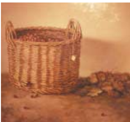
The Basket 87 x 100cm