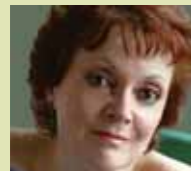
© Anne-Marie Le Bile © Russell Duncan

Saturday 21 May, 7pm Hall Two, The Sage Gateshead Tickets A/B: £20.50 C: £14.00 D/E: £7.00 Available from The Sage Gateshead Ticket Office 0191 443 4661 or www.thesagegateshead.org