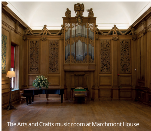
The Arts and Crafts music room at Marchmont House

A new chapter in Samling Institute's story opens this year when we begin an exciting partnership with Marchmont House in the Scottish Borders.