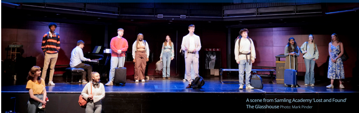
A scene from Samling Academy 'Lost and Found' The Glasshouse