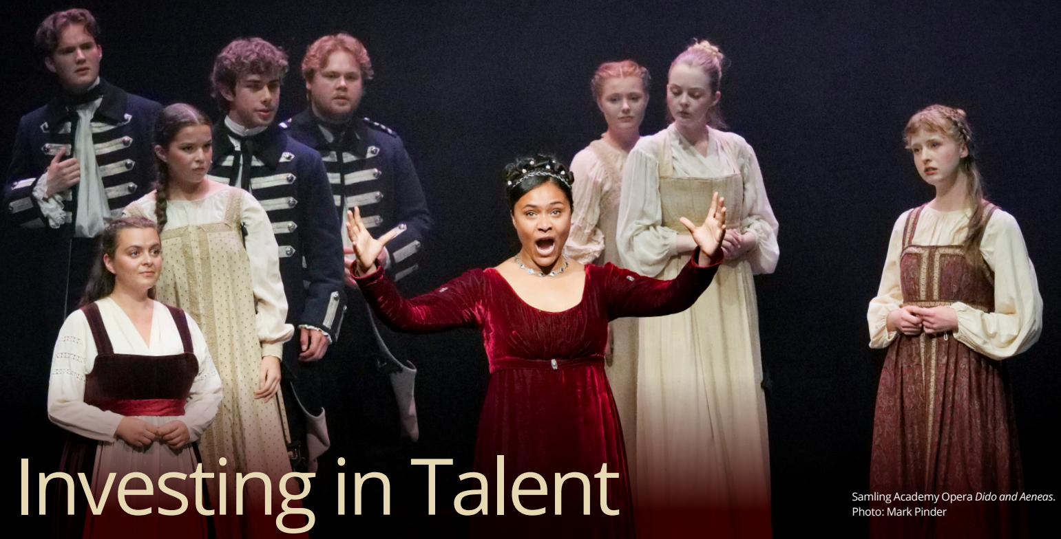
Samling Academy Opera Dido and Aeneas.